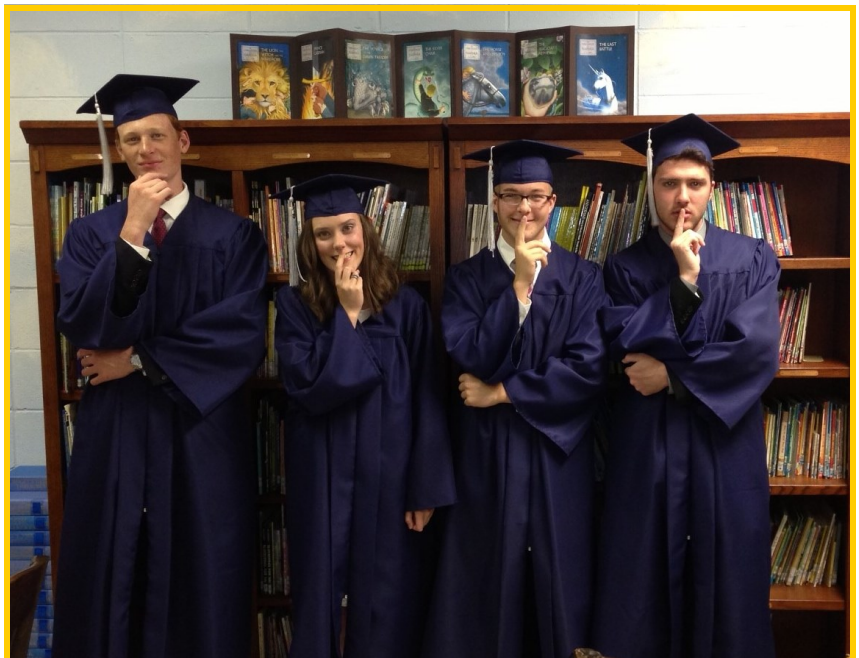
The 2013 Graduates enjoying a moment before their graduation ceremony